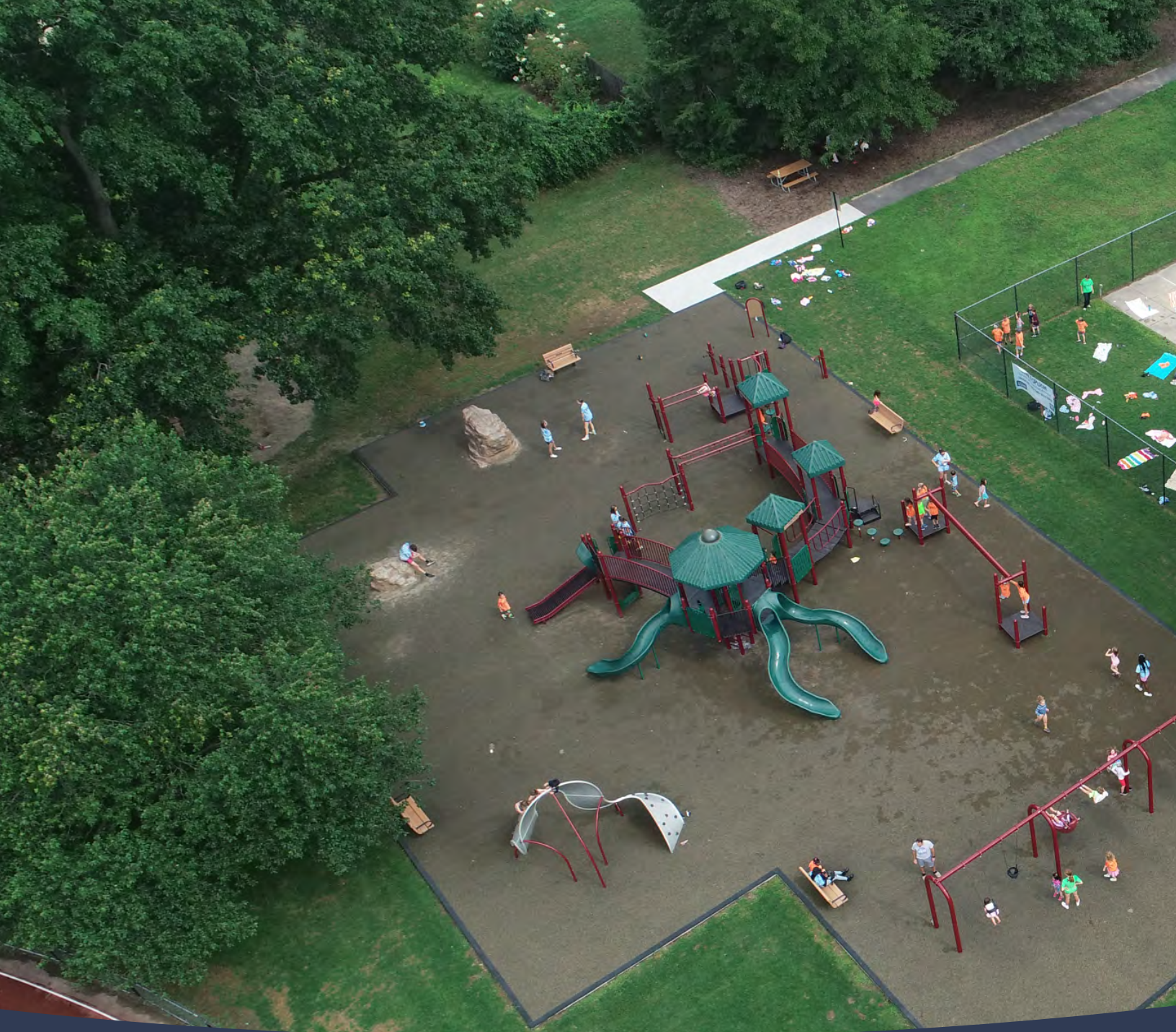
Summer camp in full swing at Emerson Playground, 2023